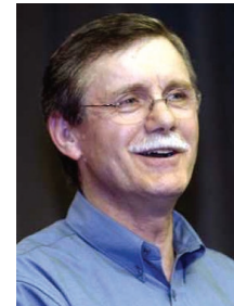
UAW boss Ron Gettelfinger has been viciously lashing out at the Foundation in dozens of newspapers in recent weeks.

The Board will reevaluate its so-called “voluntary recognition bar rule,” the non-statutory, Board-created rule stipulating that unions gaining voluntary recognition from an employer may avoid all employee challenges and bargain with an employer for a so-called “reasonable period” —